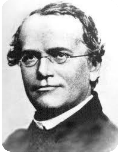
Johan Gregor Mendel (1840-1843)